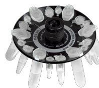
R-2/0.5/0.2 BS-010205-DK rotor

Rotor for 8 x 2/1.5 ml and 8 x 0.5 ml microtest tubes