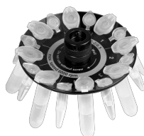
R-2/0.5 BS-010205-CK rotor

Rotor for 8 x 2/1.5 ml and 8 x 0.5 ml microtest tubes