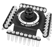
SR-32 BS-010205-FK rotor

Rotor for 2 x 8-section 0.2 ml microtube strips