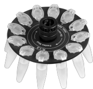
R-1.5 BS-010205-AK rotor

Rotor for 12 x 0.5 ml and 12 x 0.2 ml microtest tubes