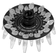
R-0.5/0.2 BS-010205-BK rotor

Rotor for 12 x 0.5 ml and 12 x 0.2 ml microtest tubes