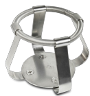
FC-250 BS-010126-JK clamp