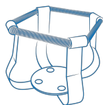
HSC-100 BS-010167-EK clam

Tight fit clamp 50 ml - Ø50 mm for UP-168