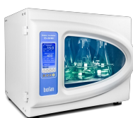
ES-20/80C Software included, without platform Orbital Shaker-Incubator with cooling