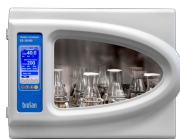
ES-20/80 Software included, without platform Orbital Shaker-Incubator