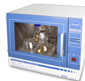
ES-20/60 Without platform Orbital Shaker-Incubator

Tight fit clamp 1000 ml - Ø130 mm for UP-168