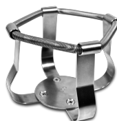
HSC-500 BS-010167-JK clamp

Tight fit clamp 250 ml - Ø85 mm for UP-168