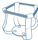
HSC-1000 BS-010167-1K clamp

Tight fit clamp 500 ml - Ø105 mm for UP-168