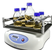
PSU-20i Without platform Multi-functional Orbital Shaker