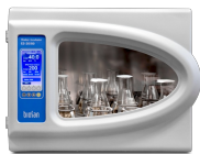
ES-20/80 Software included, without platform Orbital Shaker-Incubator

Universal platform with clamps can accommodate flasks or bottles of different volume sizes. Clamps are not included with platform and need to be ordered separately.