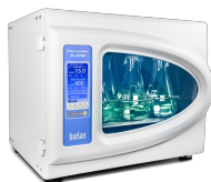
ES-20/80C Software included, without platform Orbital Shaker-Incubator with cooling