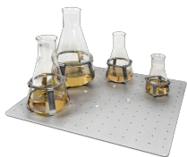
UP-168 BS-010135-JK platform

Universal platform with clamps can accommodate flasks or bottles of different volume sizes. Clamps are not included with platform and need to be ordered separately.