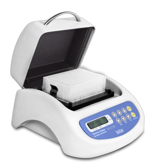
TS-DW Without thermoblock Thermo–Shaker for deep well plates

TS-DW Thermo—Shaker is designed for shaking and incubating deep well plates.