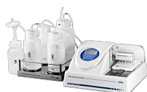
3D-IW8 BS-060102-AAI Inteliwasher