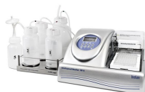
IW-8 BS-060106-AAI Intelispeed washer