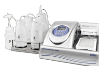
IW-8m IVD certified Intelispeed washer IVD