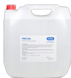
PDS-10L BS-040107-FK DNA/RNA Decontamination Solution 10l DNA/RNA Decontamination Solution.