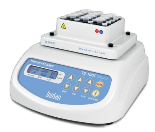
TS-100C Smart Software included, without thermoblock Thermo-Shaker with cooling for microtubes and PCR plates

TS-100C Without thermoblock Thermo-Shaker with cooling for microtubes and PCR plates