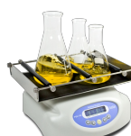
PSU-10i Without platform Orbital Shaker

Flat platform with non-slip silicone mat for Petri dishes, culture flasks, agglutination cards.