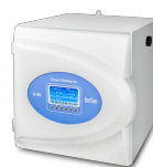
S-Bt Smart Biotherm Software included + RS6, rack with 3 shelves Compact CO 2 Incubator