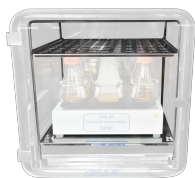
RS2 BS-010425-HK rack for CPS-20 / CTR-6 installation